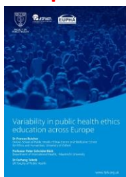
Variability in education and training in public health ethics in Europe https://www.fph.org.uk/media/3633/fph_ethics_report_08_221.pdf