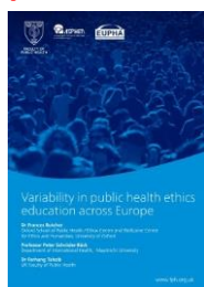
Variability in education and training in public health ethics in Europe https://www.fph.org.uk/media/3633/fph_ethics_report_08_221.pdf