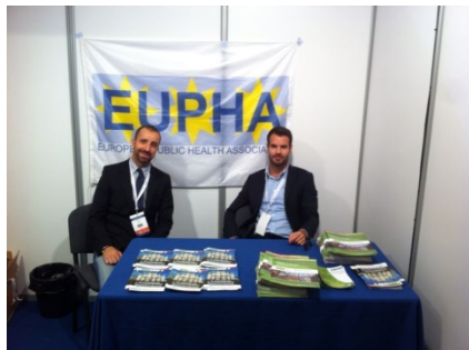
Two EUPHANxt coordinators at the EUPHA stand at the SiTI conference in Riccione, Italy, in October 2014

This year was the year of country visits. We visited representatives of our members in Austria, Croatia, Italy, Norway, Slovakia, Sweden and the United Kingdom. At the annual meeting of the World Federation of Public Health Associations (May 2014), we met with the president of our Spanish, Norwegian, and UK member and further elaborated our collaboration with the African Federation of Public Health Associations.