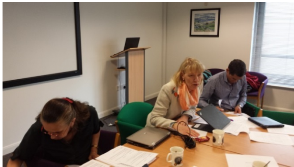
Programme planning meeting June 2014

Glasgow 2014: 'Mind the gap: reducing health inequalities in health and health care'