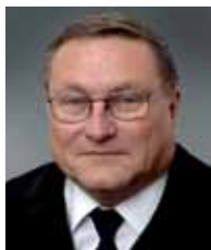
Chairman, local organising committee and president of the Danish Society of Public Health